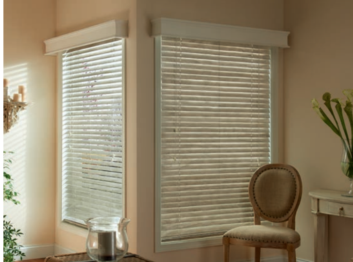
2" Wood Blinds with Cord Lift/Cord Tilt: Barnwood Windswept 1072; 5 1/2" Noble Cornice: Stucco 1963

Traditions® Wood Blinds are hand selected from the finest North American hardwood to turn every home into a beautiful masterpiece. In addition to our rich palette of stains and paints, our new Elite Wood Program includes Authentic Hardwood (Walnut, Cherry and Maple), Beaded Edge™ Slat option, Unique Finishes (Glazed, Distressed, Barnwood, Ash Wood and Bamboo) and Custom Color for one-of-a-kind creations.