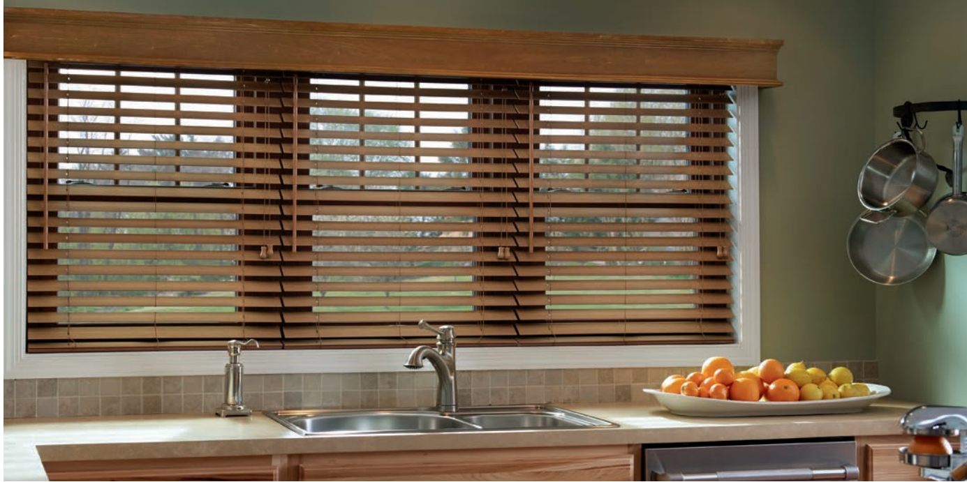
2" Premium Faux Wood Blinds, Three on One Headrail with Cord Lift/Wand Tilt: Peru 2688; 7 1/2" Noble Cornice: Peru 1688