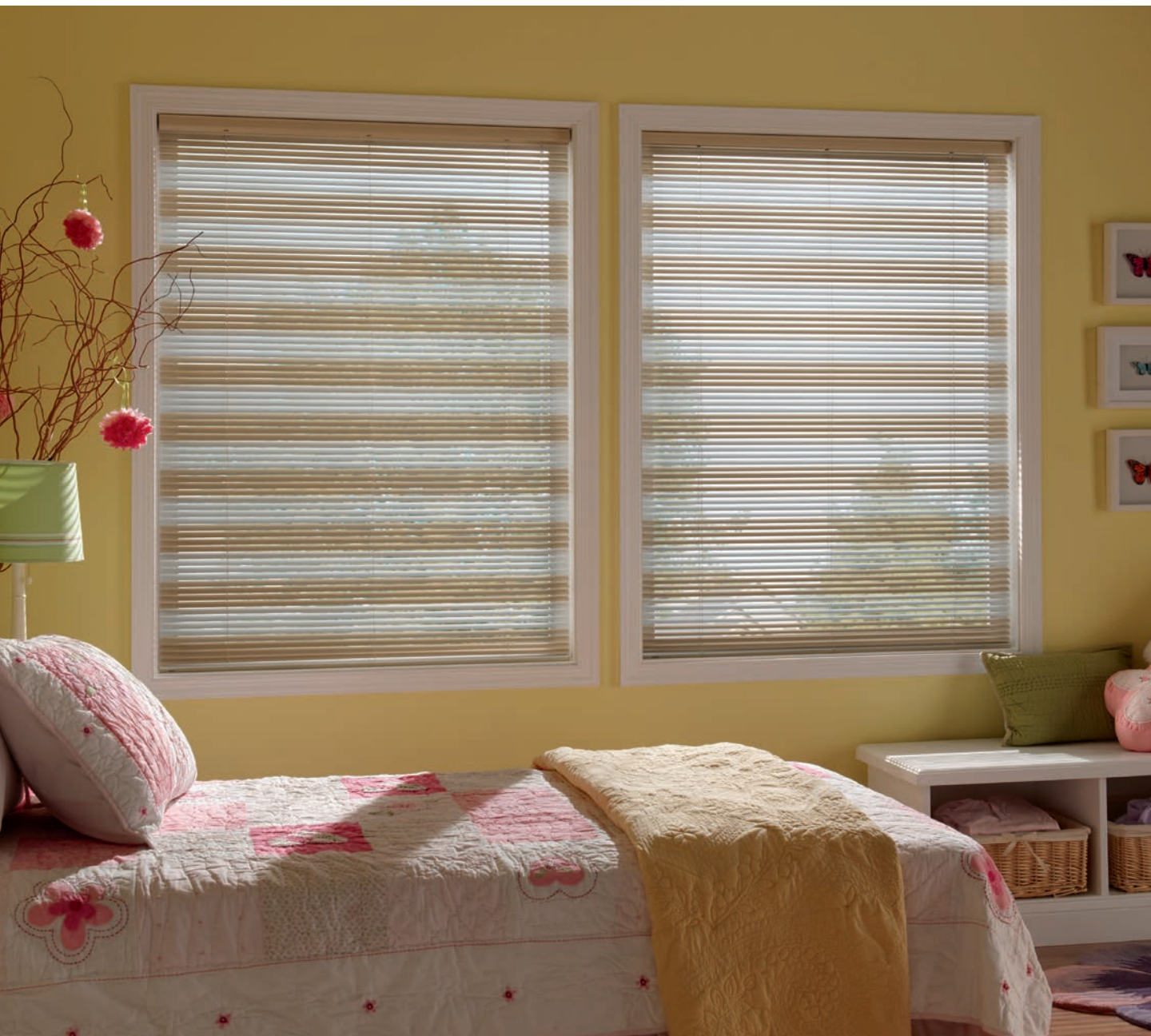
1" Cordless with Hidden Rout Holes, Canary Yellow 009 and White Pearl 637