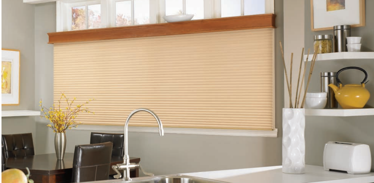
3/8" Single Cell Cellular Shade with Motorization: Scroll, Honey 1303; Noble Wood Cornice: Honey, Maple 1013