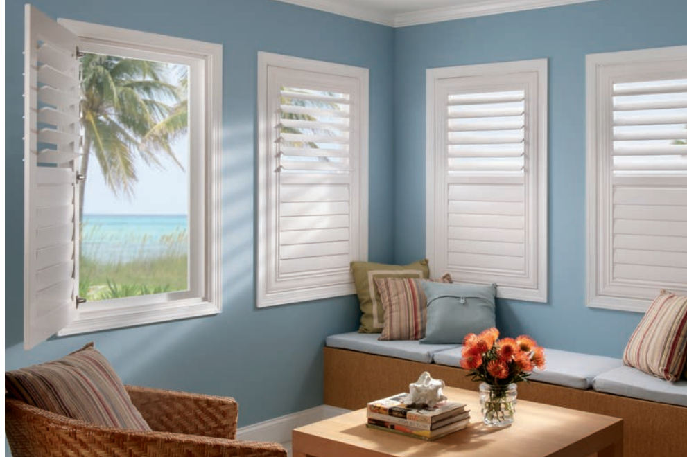
Aurora Shutters with 3 1/2" Louvers, Ornate Panel Edge, Divider Rail and Hidden Tilt: Snowflake, 1603

Aurora Shutters with 4 1/2" Louvers, Casual Panel Edge, Divider Rail and Hidden Tilt: Dover White, 1683