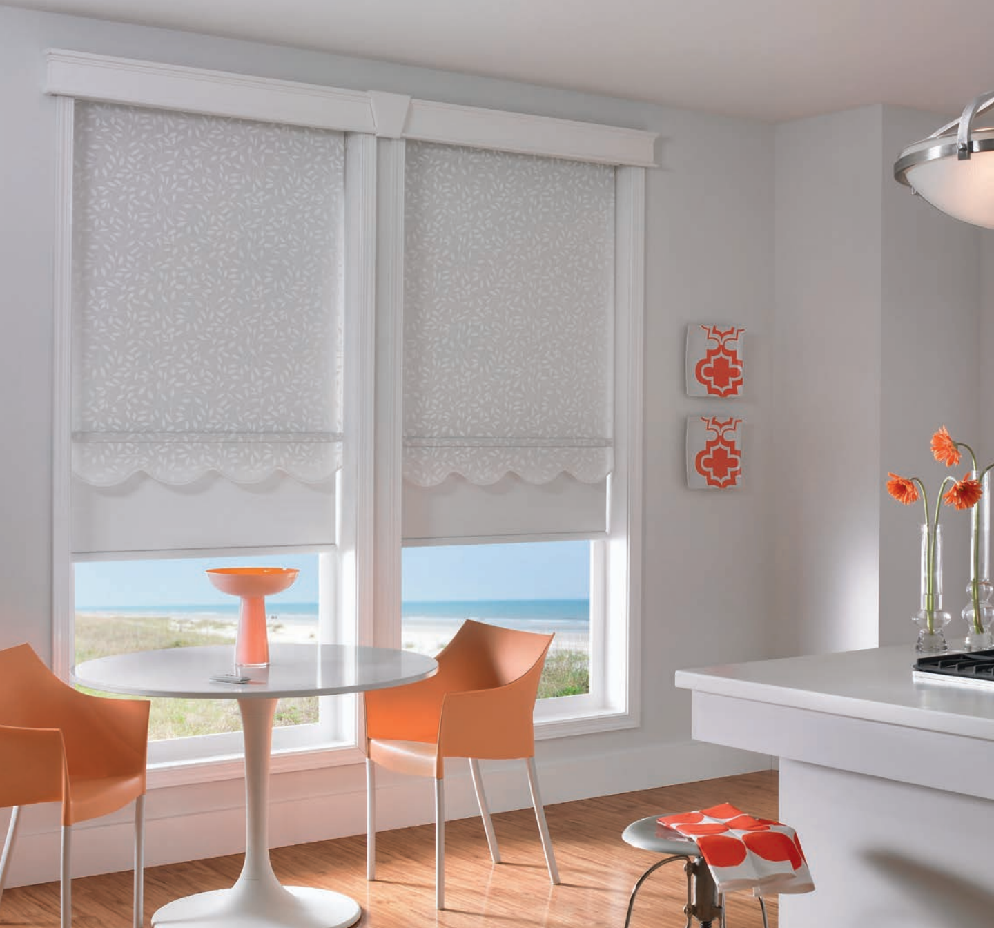
Dual Shades with Motorization: Roller Shades (Back): Cambridge Room Darkening, White 11201; Roller Shades with Classic Scallop with White Gimp 417 (Front): Monaco, Enchant 1291; 5 1/2" Noble Wood Cornice with Decorative Keystone: Snowflake 1603