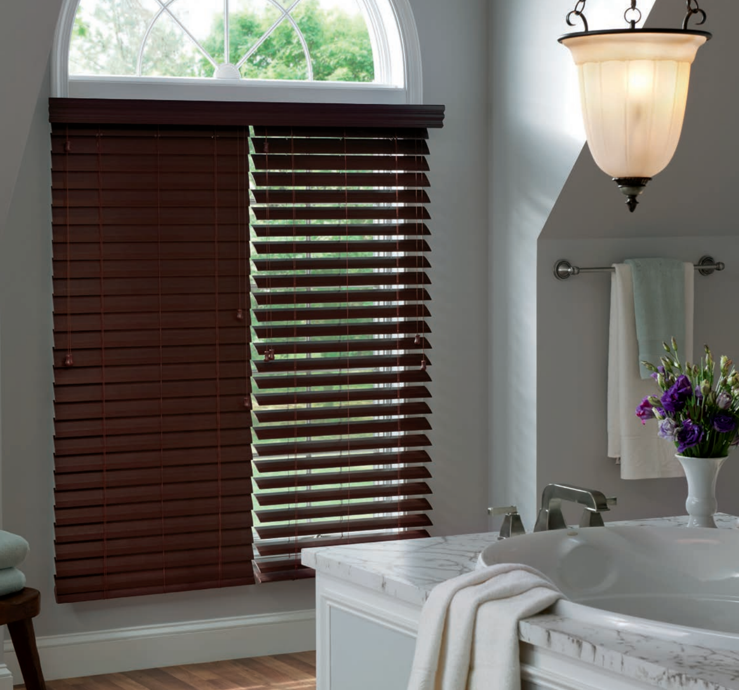
2 1/2" Composite Shutter Style Blinds Two on One Headrail with NoHoles™, Cord Lift/Cord Tilt and Majestic Valance: Dark Cherry SC316