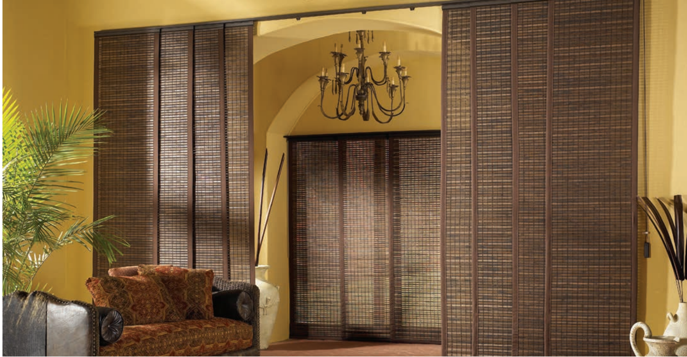
Sliding Panels, Touthan II, Mocha T3759, with 2" Edge Banding: Cocoa 1001