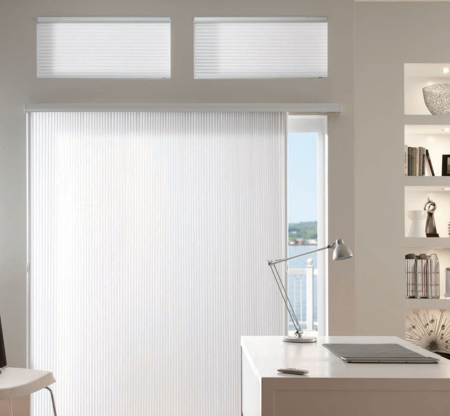
3/8" Single Cell Cellular Shade with Motorization and 3/8" Single Cell Slide-View™ with White Satin Rails: Crinkle, Snow 0254