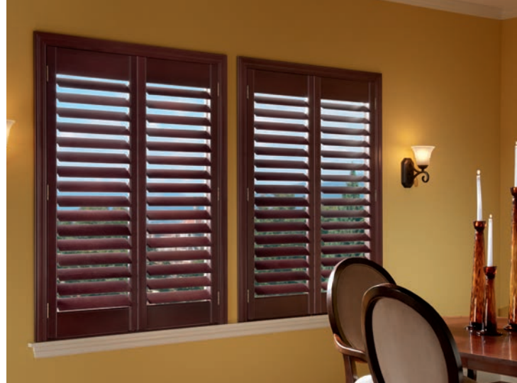
Traditions Wood Shutters with 3 1/2" Louvers, Signature Z-Frame with Astragal, Split Tilt and Hidden Tilt: Dark Cherry 1316

Crafted from renewable North American hardwood, Traditions® Wood Shutters add lasting warmth and depth to any space. An extensive assortment of upgrades and specialty options make it easy to create custom Wood Shutters that are completely unique. Graber also offers a custom color program for shutters — our design team will match any color swatch or sample provided.