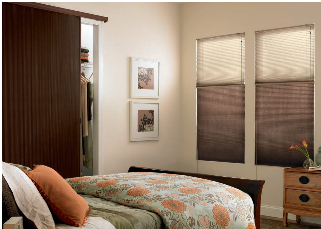
Sun Up/Sun Down 3/8" Single Cell Cellular Shades (Top): Simply Sheer, Mocha 0154; 3/8" Double Cell Cellular Shades (Bottom): Garden Retreat, Espresso 0971; 3/8" Double Cell Slide-View™ with Milk Chocolate Rails: Garden Retreat, Espresso 0971

Slide-View Vertical Cellular Shades are a great way to bring cellular style and energy efficiency to wide windows and patio doors. An easy-to-install headrail provides effortless operation. Available in three opacity levels, three cell sizes and a full spectrum of fabrics and colors that coordinate with our CrystalPleat® Cellular Shades.