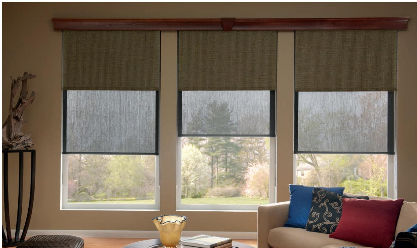
Dual Shades with Continuous-loop Lift: Solar Shade (Back): A100, Charcoal V2125; Roller Shade (Front): Bungalow, Oregano 28006; 5 1/2" Regal Wood Cornice with Decorative Keystone: Saddle Brown 1694