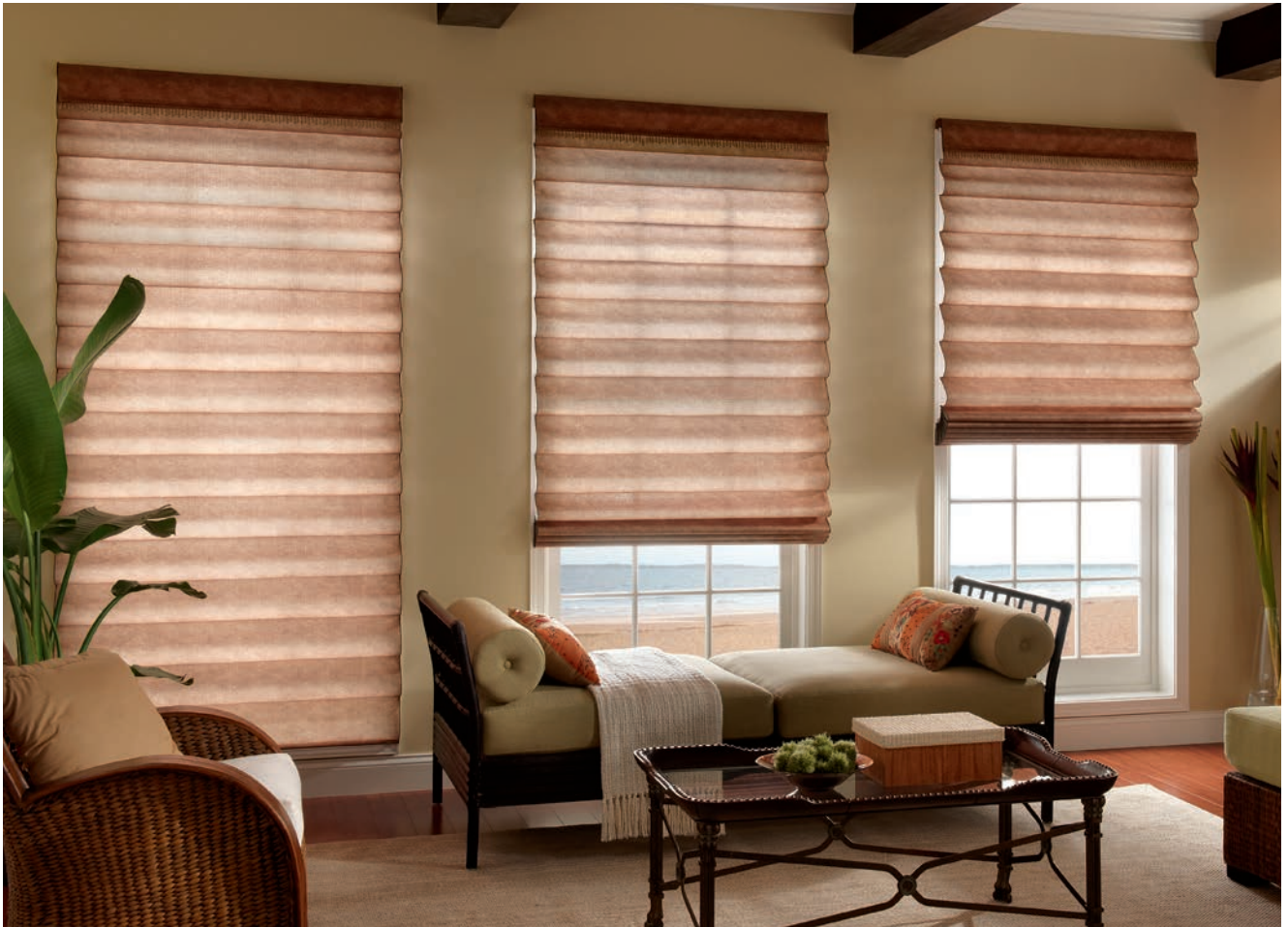
Looped Roman Shades with Motorization, 5 1/2" Standard Valances and Wood Bead Trim in Washed Oak 101: Sahara, Rust 3440

Roman Shades combine the up-scale beauty of soft drapery with the convenient operation of a shade. Choose from an extensive selection of fabrics from timeless to ultra modern to create an atmosphere of high-style sophistication that's sure to impress. Available in Classic Flat and Teardrop Looped styles.