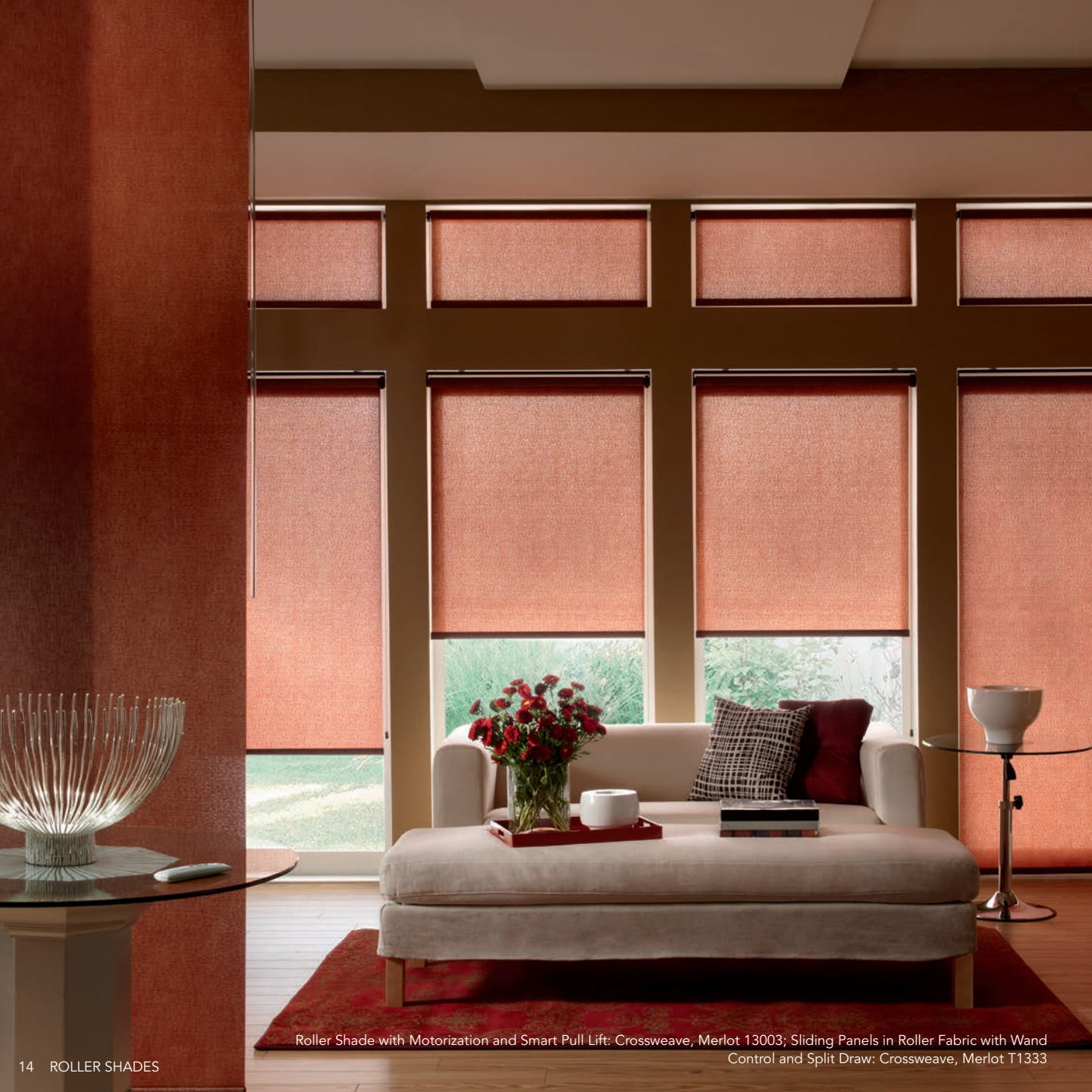
Roller Shade with Motorization and Smart Pull Lift: Crossweave, Merlot 13003; Sliding Panels in Roller Fabric with Wand Control and Split Draw: Crossweave, Merlot T1333