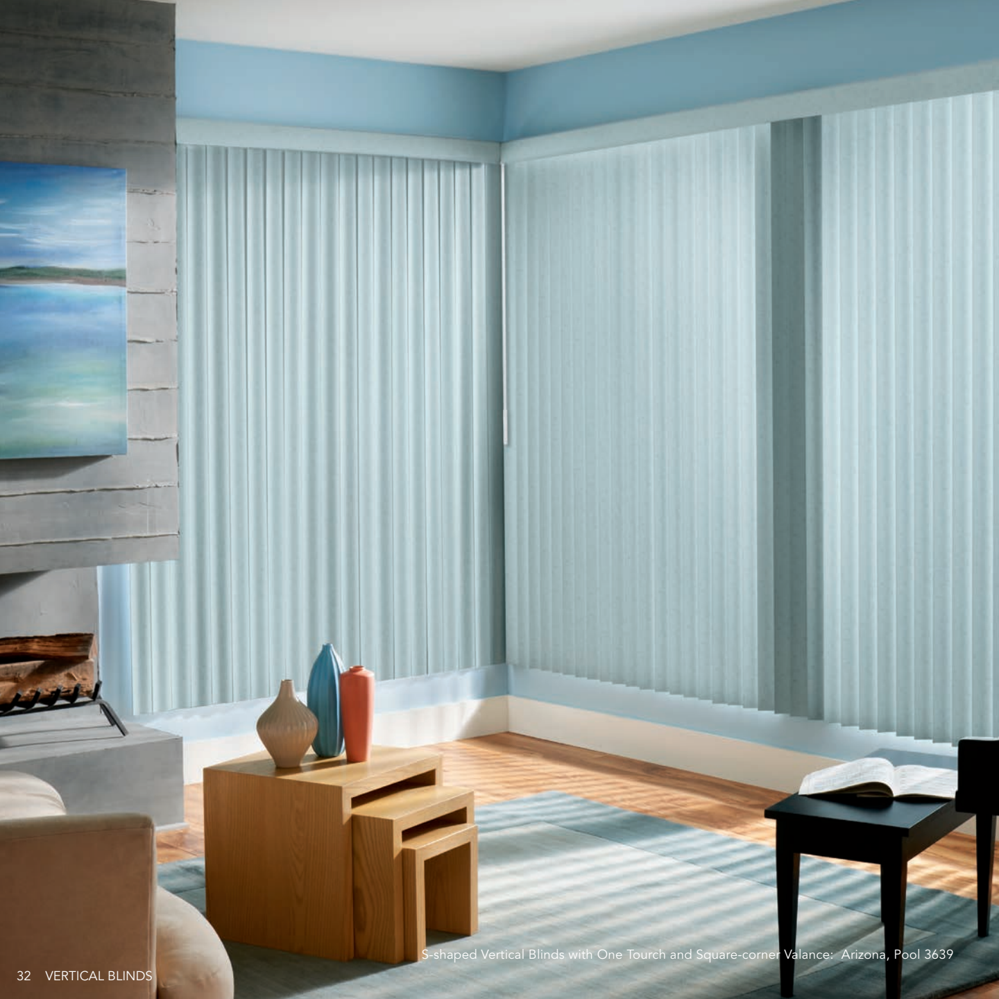
S-shaped Vertical Blinds with One Touch and Square-corner Valance: Arizona, Pool 3639