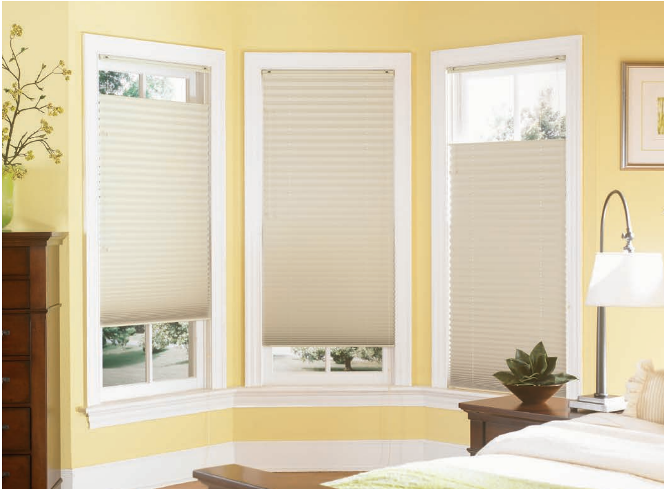
Pleated Shades with Corded Bottom Up/Top Down: Grace, Doe 0102

Elegant Pleated Shades combine an eye-catching design with the beautiful colors and patterns of fabrics ranging from sheer to semiprivate. EvenPleat® Shades feature a patented design that will not sag or stretch over time, while FashionPleat® Shades are a more economical alternative with the same great pleated style.