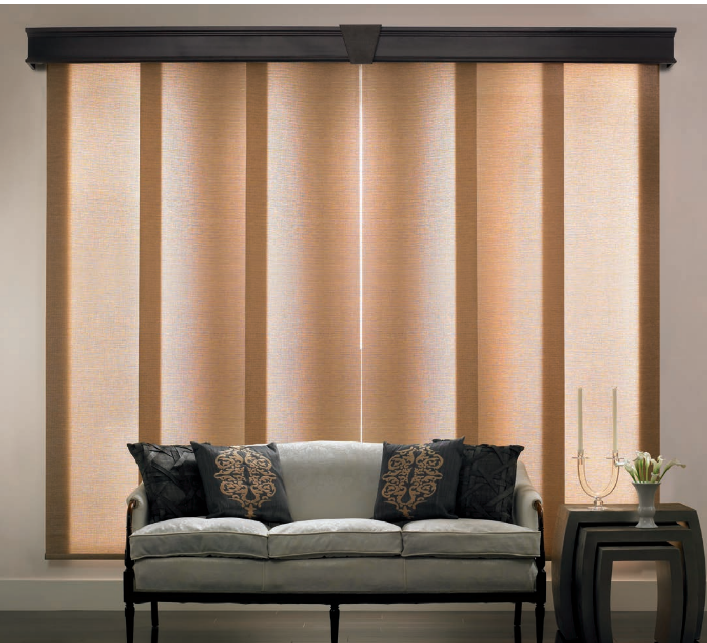
Sliding Panels in Roller Fabric with Wand Control and Split Draw: Celeste, Earth Glow T1282; 7 1/2" Noble Wood Cornice with Decorative Keystone: Saddle Brown 1694