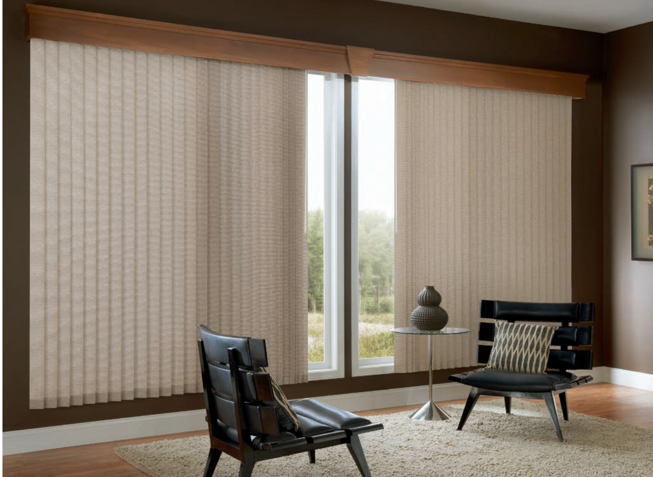
Vertical Blinds with One Touch: Devon, Plymouth 0030; 7 1/2" Noble Cornice with Keystone: Walnut 1012