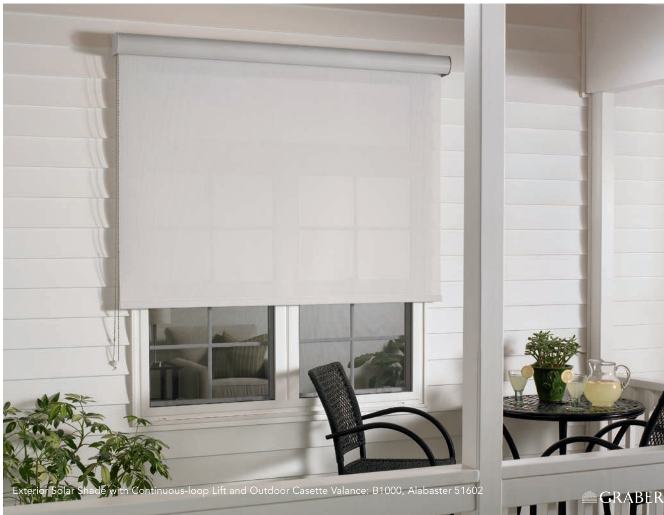
Exterior Solar Shade with Continuous-loop Lift and Outdoor Cassette Valance: B1000, Alabaster 51602

Enjoy the benefits of Solar Shades year round. Installed to the outside of a window or patio, they block the sun's harmful rays before they reach your window. This greatly reduces air-conditioning costs and, like standard Solar Shades, maintains your exterior view while minimizing glare.