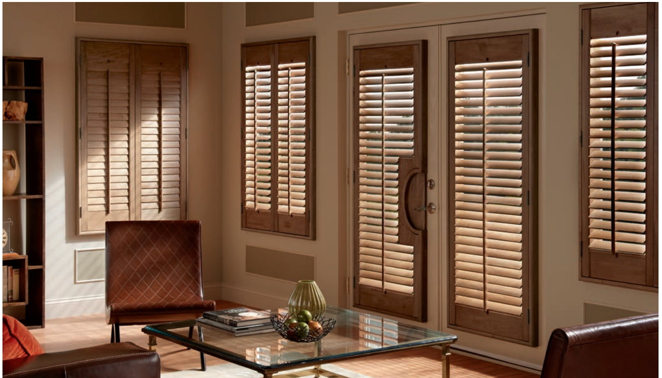
Traditions Wood Shutters with 2 1/2" Louvers, French Door Cut-outs, Bull Nose L-Frame, Standard Tilt with Double Mouse Holes: Wheat 1710