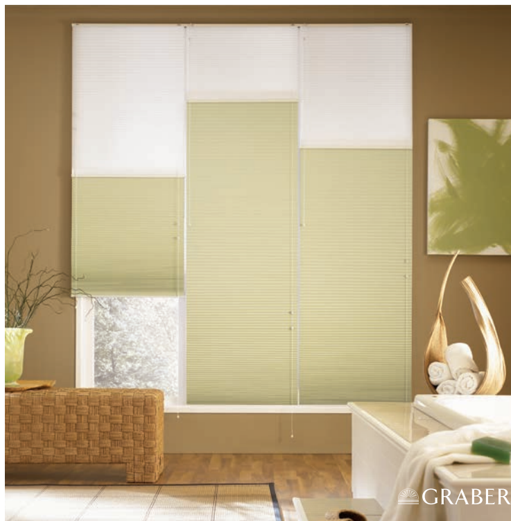
3/8" Single Cell Cellular Shades with Sun Up/Sun Down (Top): Translucence, Jack Frost 5100; 3/8" Single Cell Cellular Shades (Bottom): Cocoon, Seedling 0441

CrystalPleat® Cellular Shades feature a unique cellular design that insulates windows to keep rooms warmer in the winter and cooler in the summer. Available in three opacity levels, three cell sizes and a range of on-trend fabrics and exciting colors.