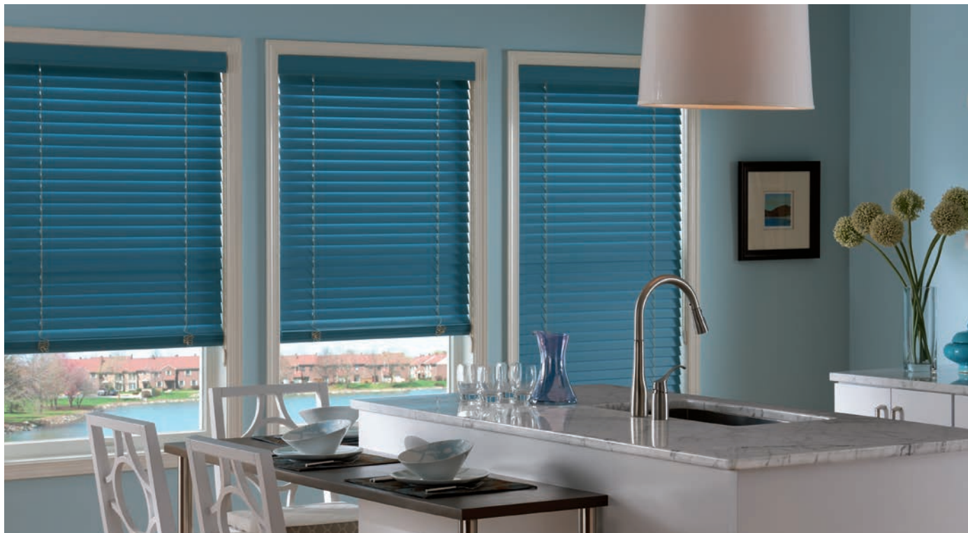
2" Elite Wood Blinds with Simpull: Custom Color Paint