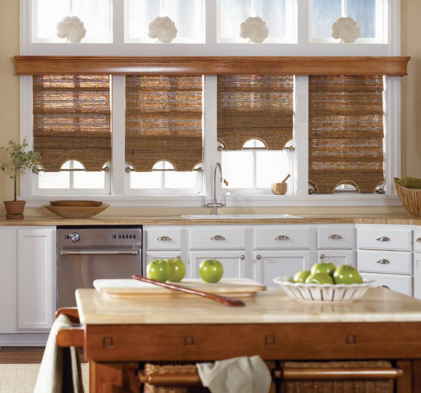
Looped Natural Shades, Meilin, Camel 51086, 5½" Regal Wood Cornice, Honey Maple 1013; Deco-Pocket Hem, Cathedral, Antique Brass 06 Accent Rod, 7/16" Gimp Trim, Maize 02